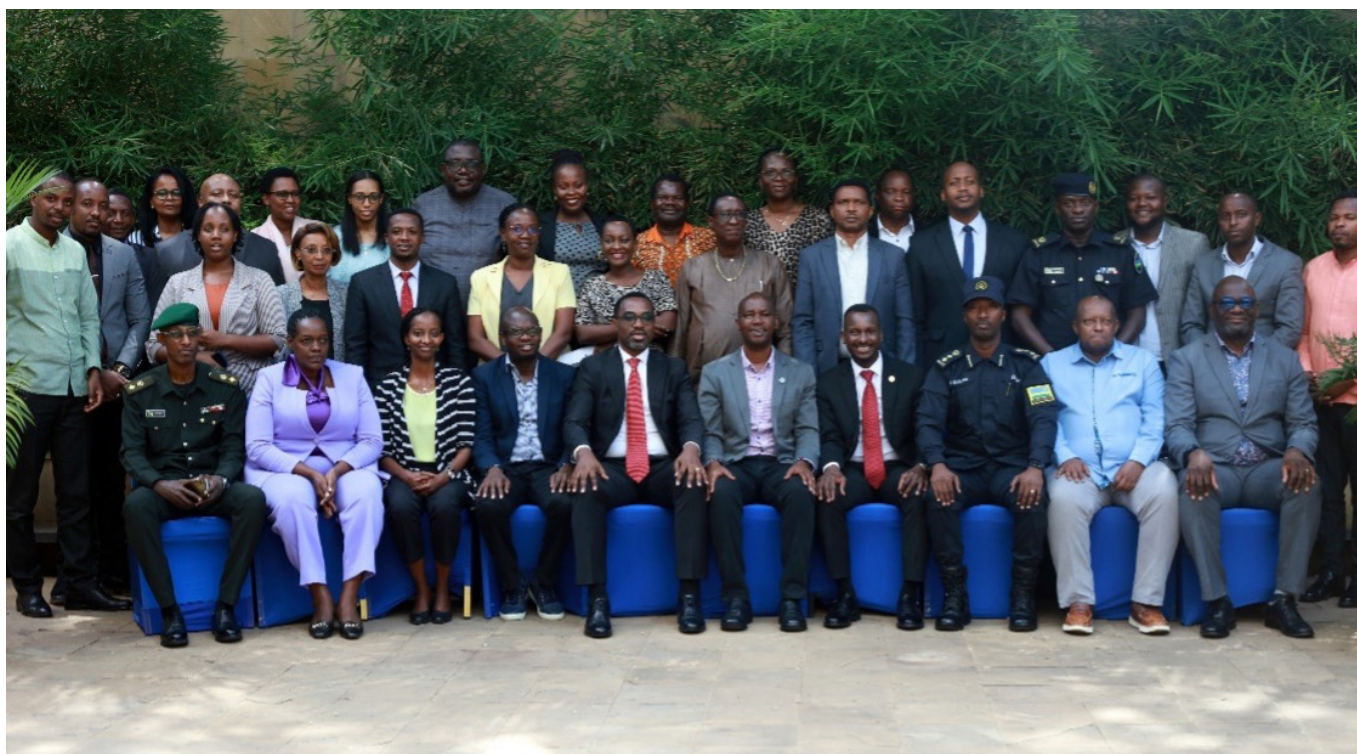
Delegates at the COMWARN SVA Consultation Workshop in Rwanda

Half of COMESA countries have successfully conducted the Regional Early Warning Structural Vulnerability Assessments which help nations in understanding both their resilience and vulnerabilities to peace and prosperity in the context of the COMWARN early warning model. This understanding has helped countries to commence the development of mitigation strategies to enhance their resilience.