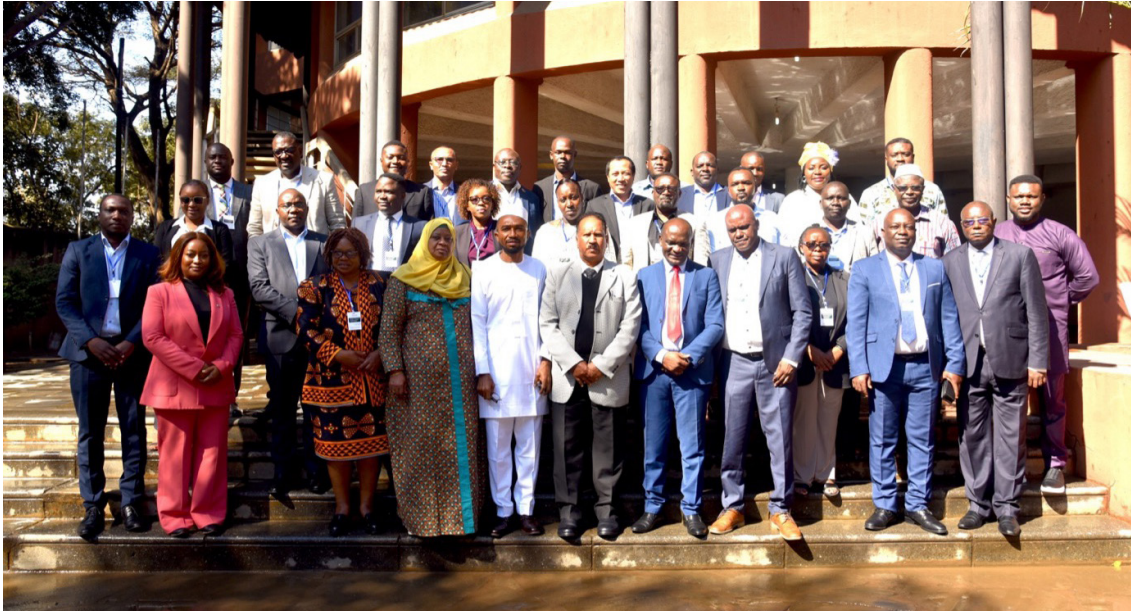
Participants to the Carbon Markets Workshop at the Secretariat in Lusaka