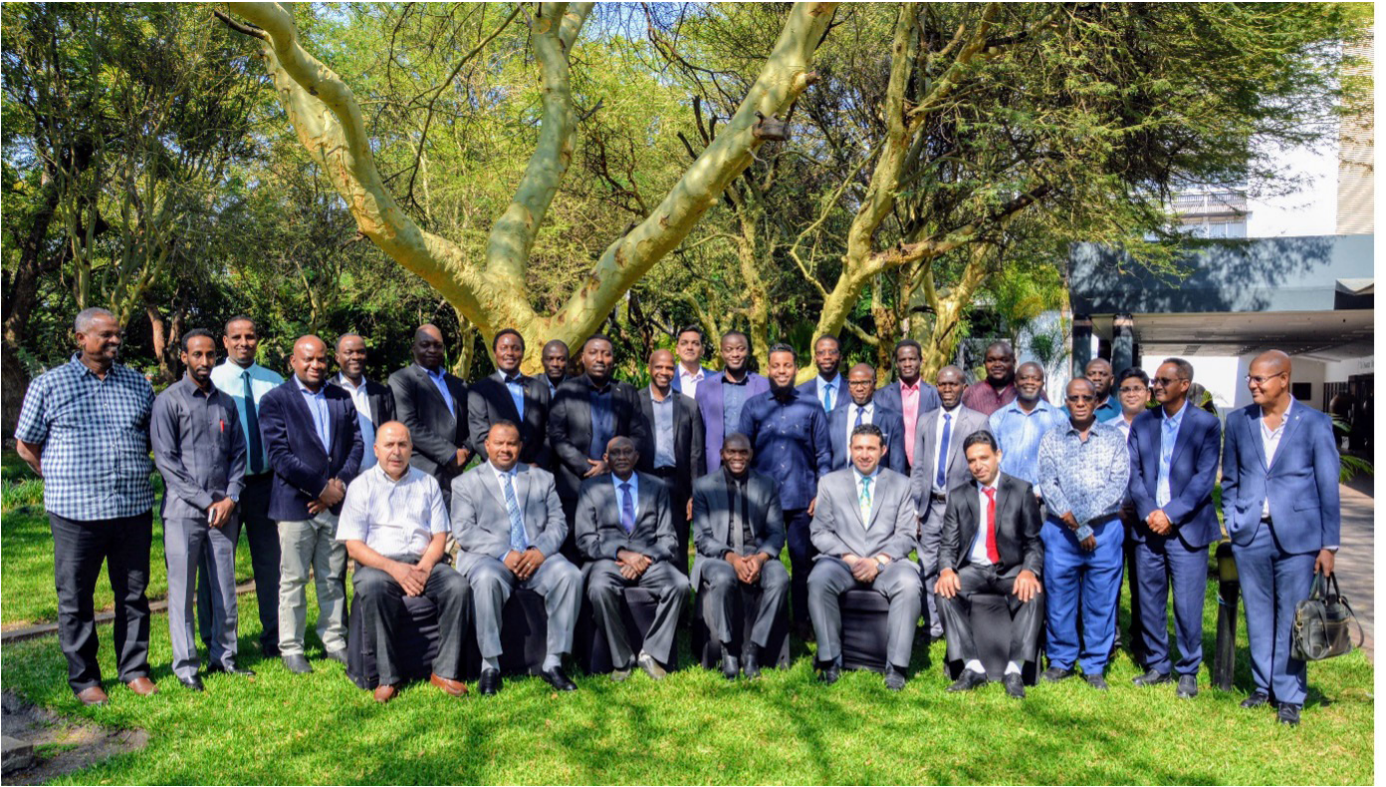
Delegates at the Consultative Workshop held in Lusaka