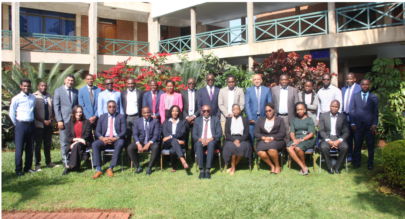
Delegates at the Applications of Data Science for Analysis of Financial Stability", training held for Central Banks from 27th – 31st May 2024, in Nairobi Kenya.