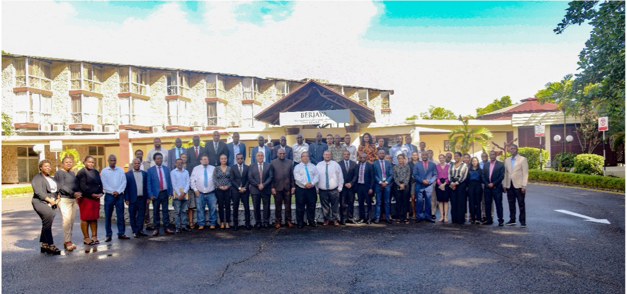
Participants to the validation workshop on the development of cost-based models to sustain revenues for regulatory bodies

On 3 – 5 June 2024, COMESA hosted a validation workshop on the development of cost-based models to sustain revenues for regulatory bodies in the Eastern Africa, Southern Africa, and Indian Ocean (EA-SA-IO) region. Held in Mahe, Seychelles, the forum marked a crucial step towards enhancing independent and transparent aviation oversight in compliance with International Civil Aviation Organization (ICAO) standards. The ICAO mandates contracting States to ensure the availability of services that facilitate international air navigation, requiring that safety, security, and economic regulators are independent of the organizations they regulate. This separation is aimed at eliminating any potential conflict of interest, ensuring all service issues remained outside regulatory control.