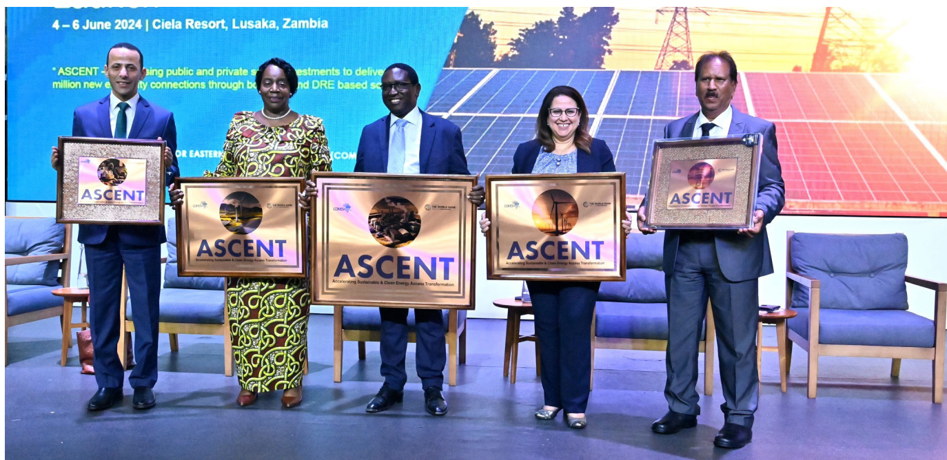
Symbolic launch of the Accelerating Sustainable and Clean Energy Access Transformation (ASCENT) programme by World Director of Regional Integration Africa, Middle East and North Africa H.E Ms. Boutheina Guerhazi and SG Chileshe Mpundu Kapwepwe alongside Honourable Peter Kapala, Minister of Energy of Zambia. ASG programmes Ambassador Kadah and ASG Finance and Administration Dr Dev Haman both at the far end.

COMESA and the World Bank have launched a USD 5 Billion energy programmes dubbed the Accelerating Sustainable and Clean Energy Access Transformation (ASCENT) programme. ASCENT programme is aimed at accelerating energy access efforts in the eastern and southern African region, with a target delivery of new electricity connections for 100 million people.