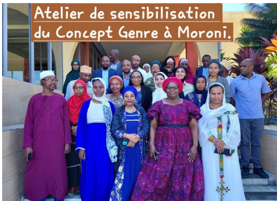
Delegates at the National Gender Sensitisation Workshop in Comoros

Comoros is the latest beneficiary of a COMESA-led National Gender Sensitisation for stakeholders on various policy frameworks covering the COMESA Treaty, Social Charter, the Gender Policy, the Gender Policy Implementation Plan and on the Gender Mainstreaming Guidelines.