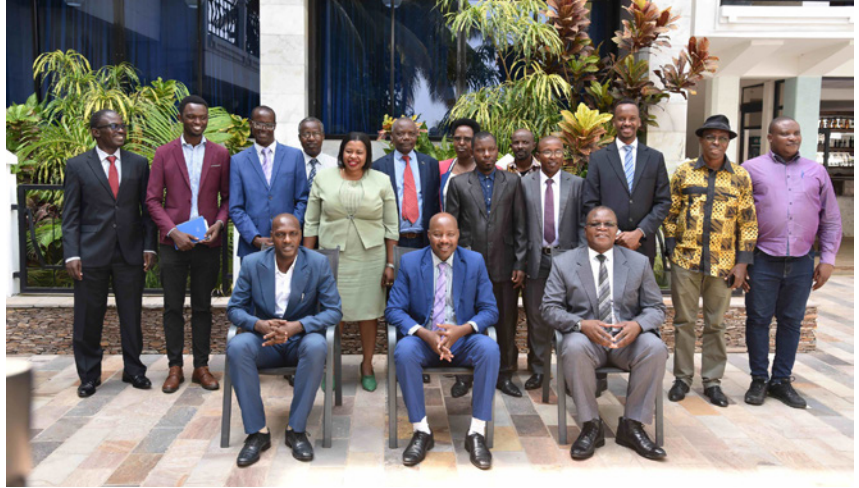
Burundi stakeholders' awareness workshop on the single African air transport market in Bujumbura

Participants at the workshop included members of the national monitoring committee, members of the Kenya cross border trader's association, representatives of the transporters association and the private sector. It was funded by the European Union through the European Development Fund 11 under the COMESA Trade Facilitation Programme.