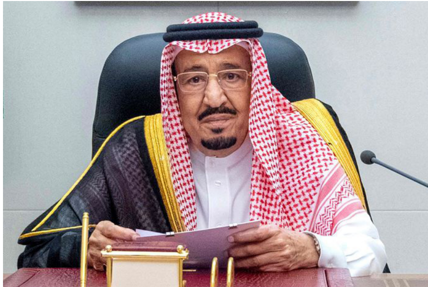
Saudi Arabia's King Salman bin Abdulaziz