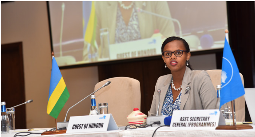
Rwanda Minister of State for Infrastructure, Eng. Patricie Uwase addressing the 13th meeting of infrastructure ministers