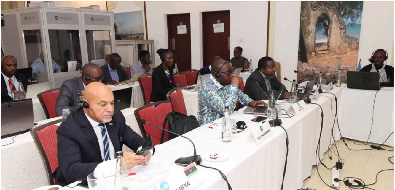
Participants in the 13th Meeting of the Committee on Trade in Services in Mombasa, Kenya