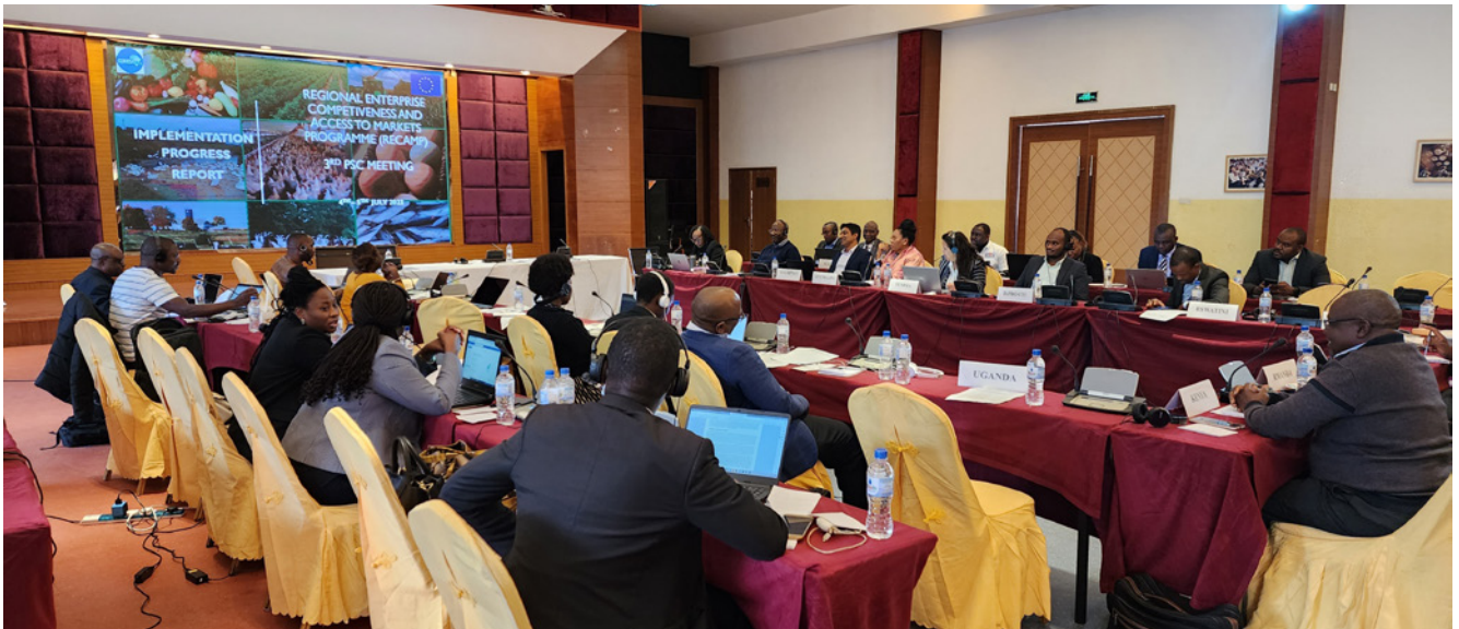
The last RECAMP PSC Meeting in Malawi