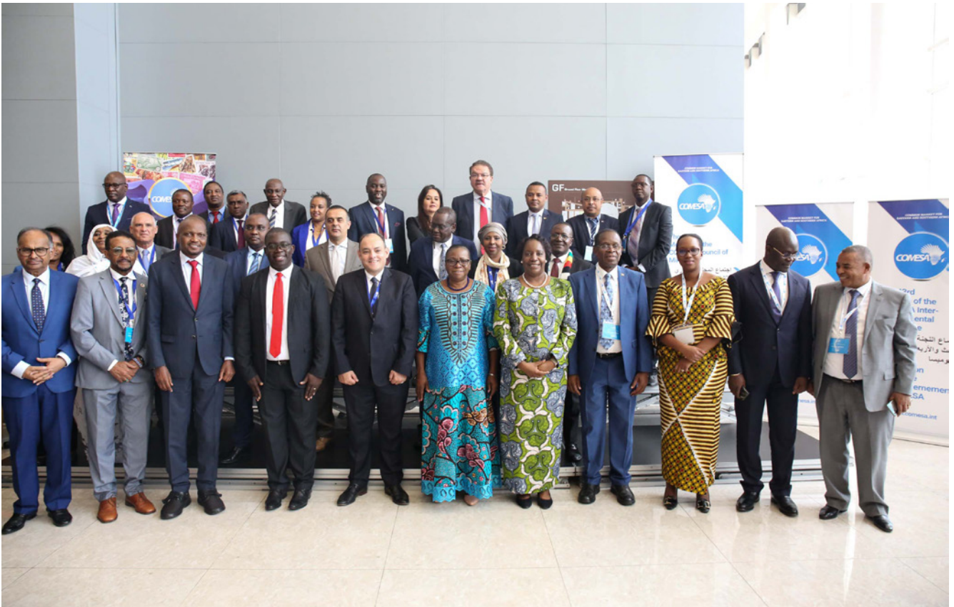
File photo: 2022 COMESA Council of Ministers