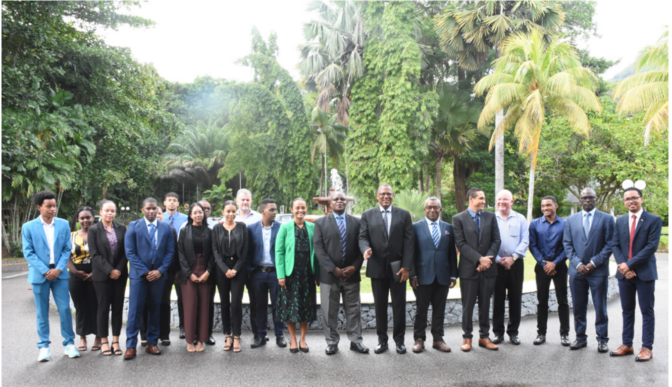
Participants to the SAATAM Awareness workshop in Mahe, Seychelles