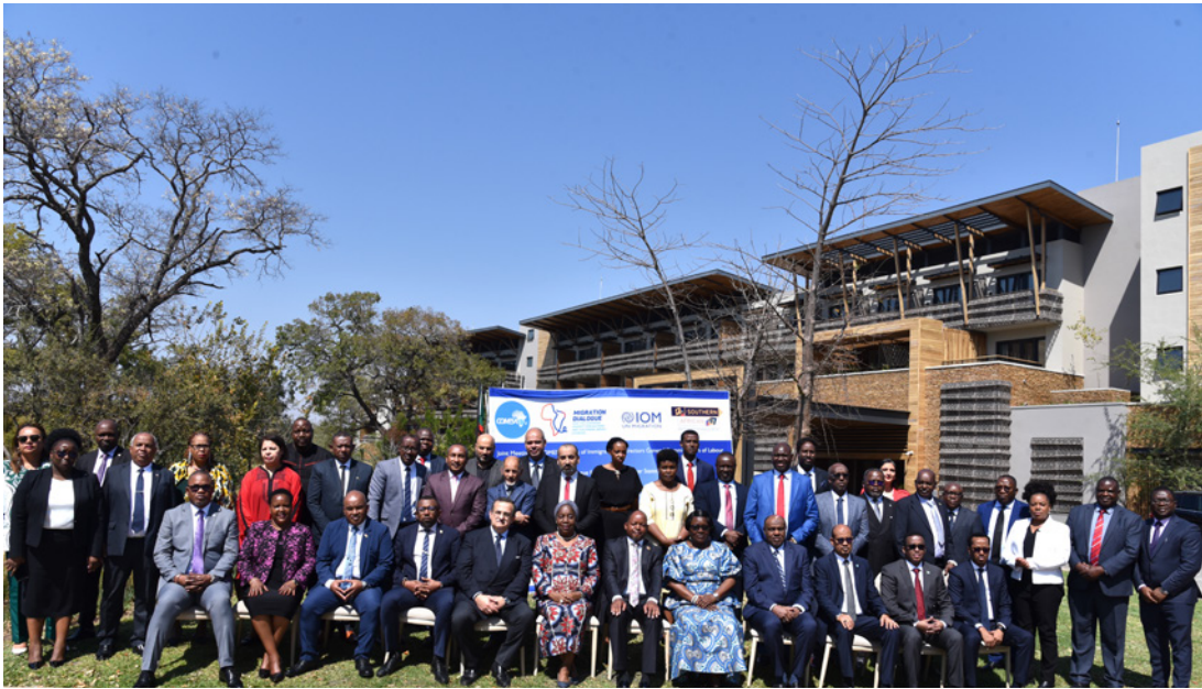
Immigration and labour ministerial meeting in Livingstone, Zambia