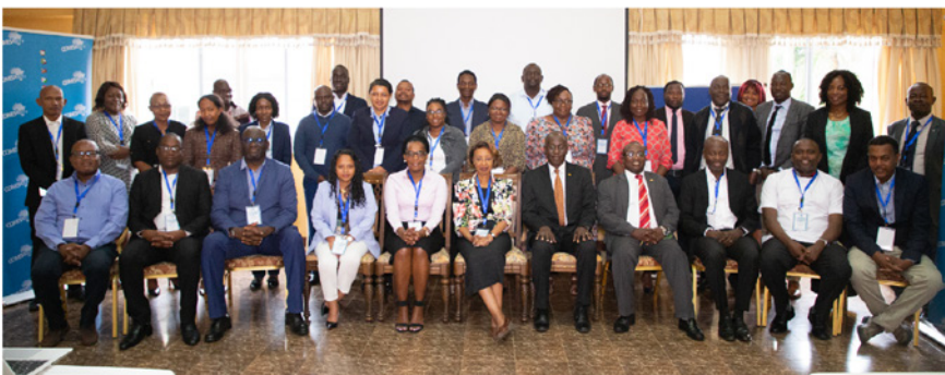
Participants in the training in Uganda

COMESA Member States have developed new targets to enhance the implementation of the COMWARN Structural Vulnerability Assessments (SVAs) at the national level. This is done through early identification of future potential country-specific and regional