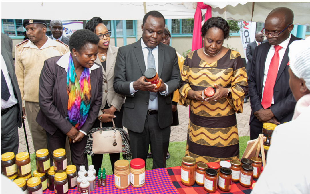
COMESA Secretary General Chileshe Mpundu Kapwepwe (2nd right) and delegates touring the exhibition stands at the launch of the BIAWE Project in Nairobi