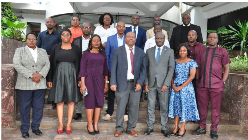
Participants at the RFBS Project Focal Points/Experts at Quality Data Production Training in Nairobi

The next course of action was to conduct similar training at Kasumbalesa after which the launch of the training programme was planned in Lusaka later in the year. The traders in Chirundu, Mwami/Mchinji have already been trained.