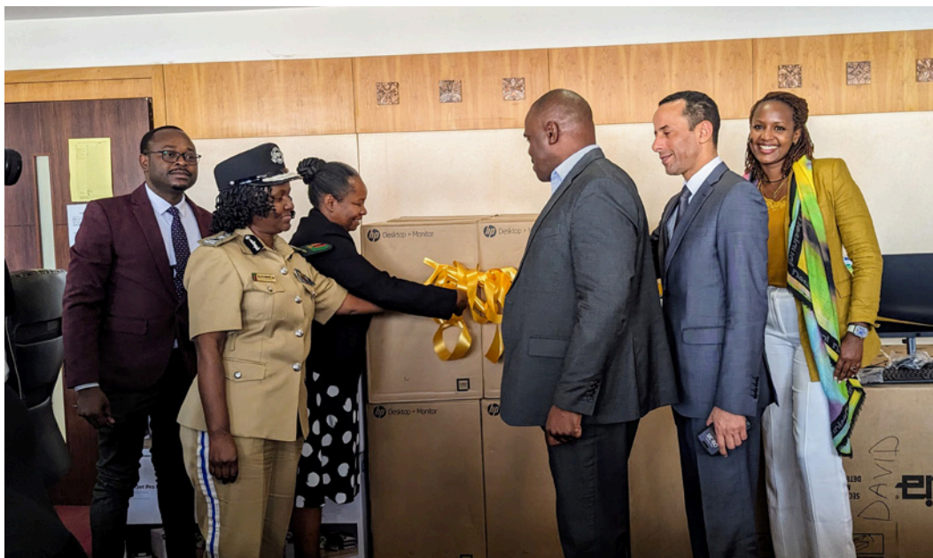
Handing over equipment to enhance border security