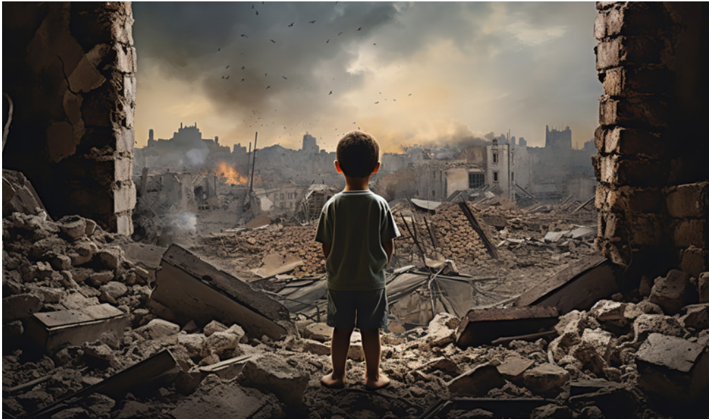
file photo: effects of conflicts