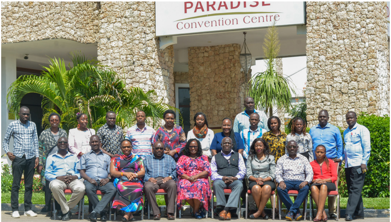
Workshop on the development of the draft National Strategy on the Elimination of NTBs in Kenya