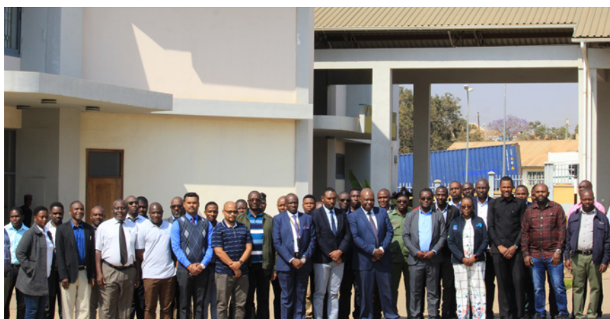
Stakeholders at the Tunduma project site

He noted the limited timeframe remaining to deliver on the TFP and called for close collaboration between the Tanzania Revenue Authority, Ministry of Trade, COMESA Secretariat and the contract managers.