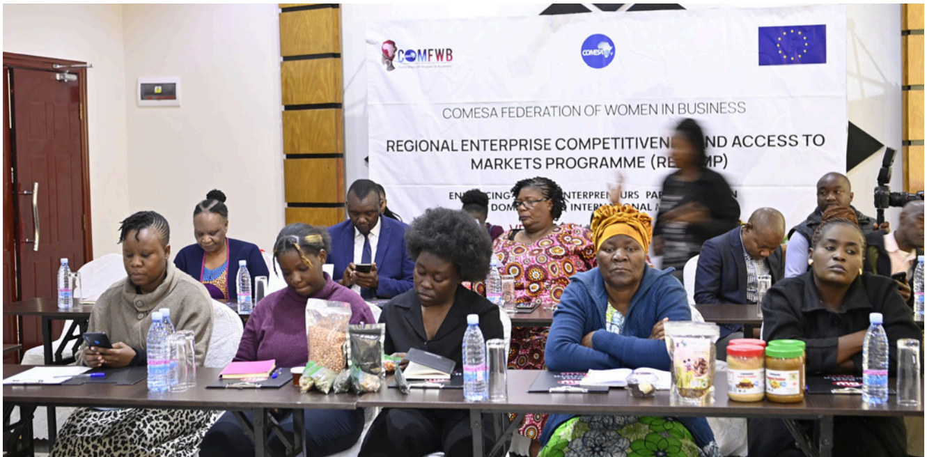
Participants at the COMFWB RECAMP training in Lusaka