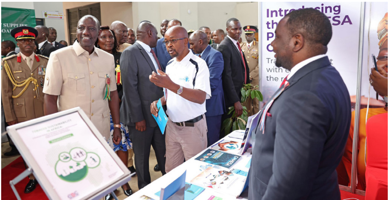
President William Ruto of Kenya at the COMESA stand in Nairobi