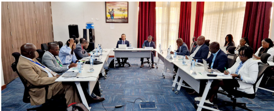
COMESA Climate Change Programme Steering Committee (PSC) meeting in session