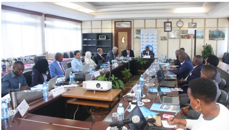
File: A training session at the COMESA Monetary Institute