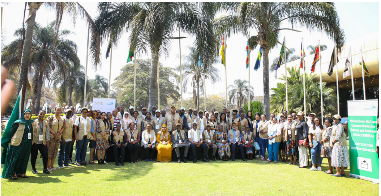
Mission Leaders with observers ready to be deployed to the Zimbabwe elections.