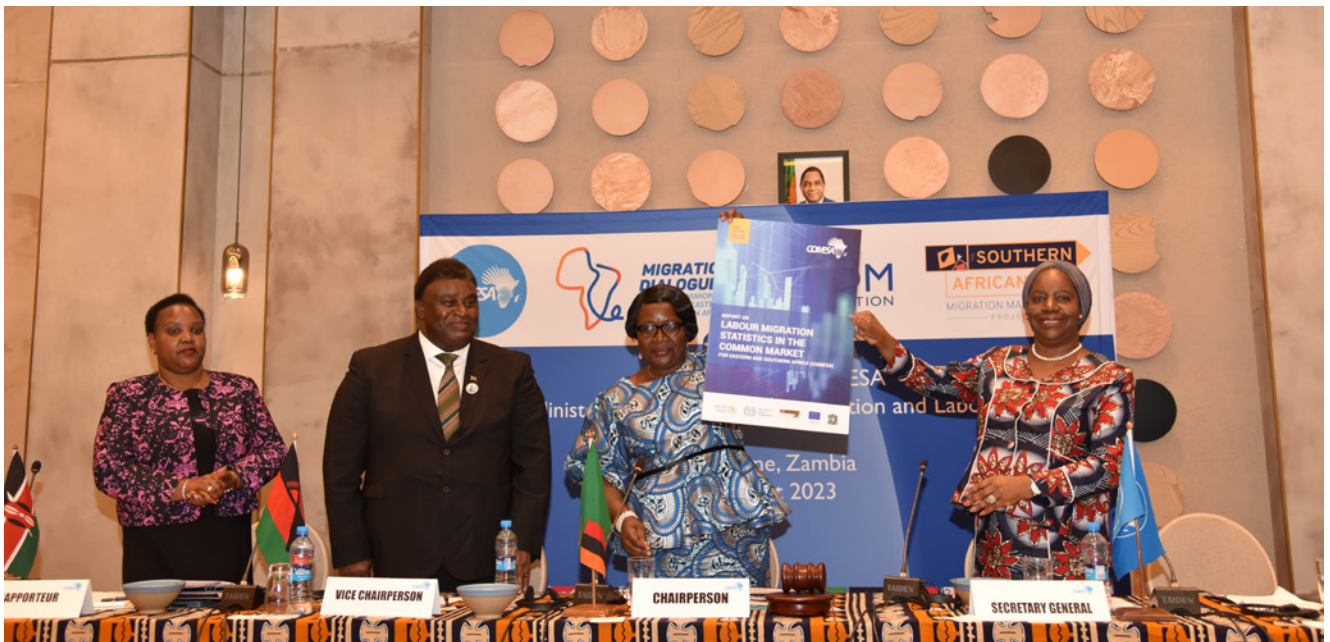
COMESA Secretary General Chileshe Kapwepwe (R) and Zambia Minister for Labour and Social Security Hon. Brenda Mwika Tambatamba launches the COMESA Labour Migration Statistics Report with Labour Minister Hon Florence Bore, (Kenya) and Home Affairs Minister Hon. Kenneth Zikhale Ng'oma (Malawi).