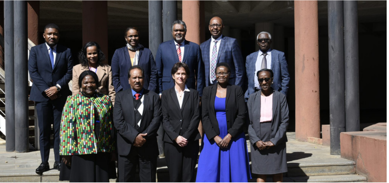
Participants at the COMESA AU/AGA Meeting in Lusaka