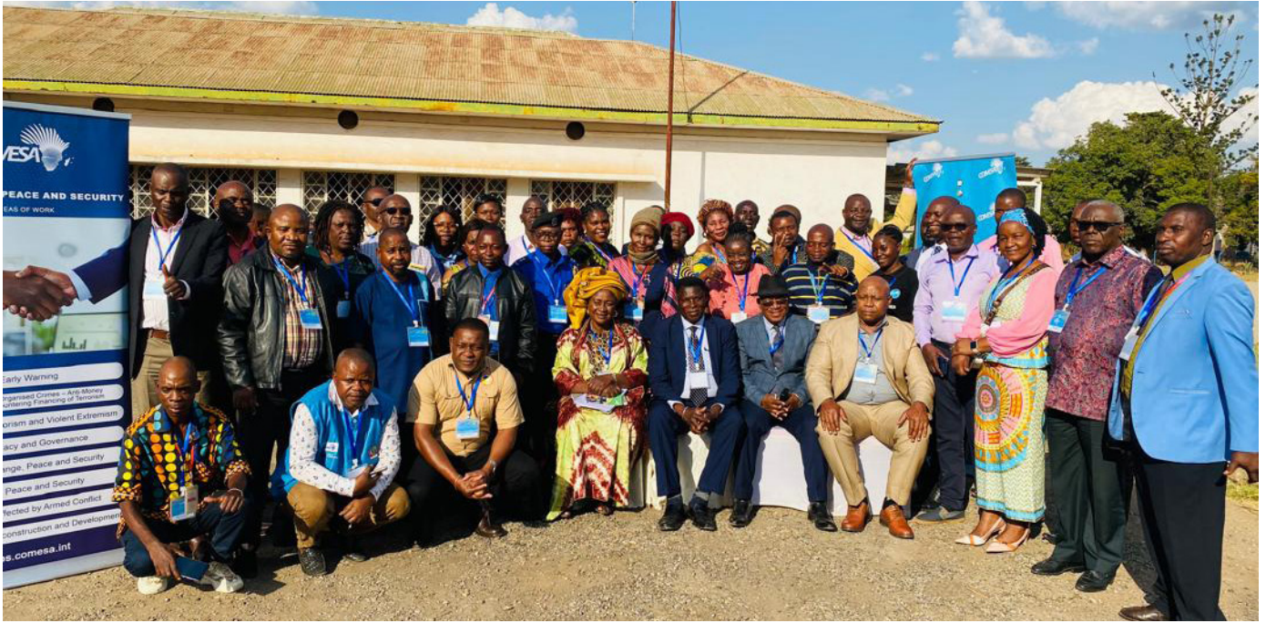
The Capacity Building workshop of officials based at Kipushi border