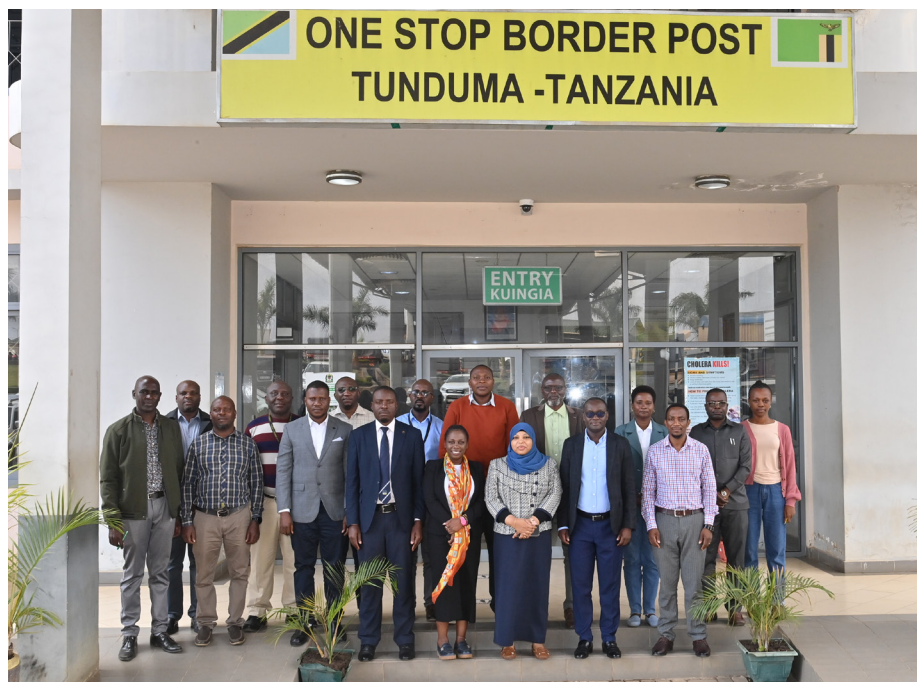
A joint supervision team from COMESA, Ministry of Industry & Trade in Tanzania and Projects Manager at Tunduma OSBP