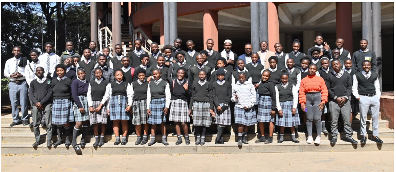
Over 50 Grade 12 pupils from Twalumba Secondary School in Barlastone, Lusaka, conducted a study tour of COMESA Secretariat on May 13, 2024. The tour aimed at helping students learn about COMESA's programs and regional integration activities.

Additionally, she expressed optimism that the grant will assist in providing critical data to inform the implementation of the country's long-term low-emission development strategy and its revised NDCs to the United Nations Framework Convention on Climate Change. Zimbabwe is a party to this framework, as well as to the Paris Agreement and the Montreal Protocol on substances that deplete the ozone layer.