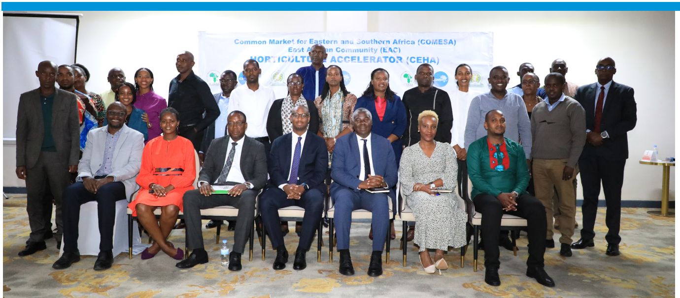
Delegates at the launch of the CEHA Rwanda National Chapter in Kigali

A regional program to boost the horticulture industry in five countries in eastern and southern Africa has been launched in Rwanda. The COMESA, East African Community (EAC) Horticulture Accelerator (CEHA) Programme aims to accelerate the growth of the fruit and vegetable sub-sector in these regions.