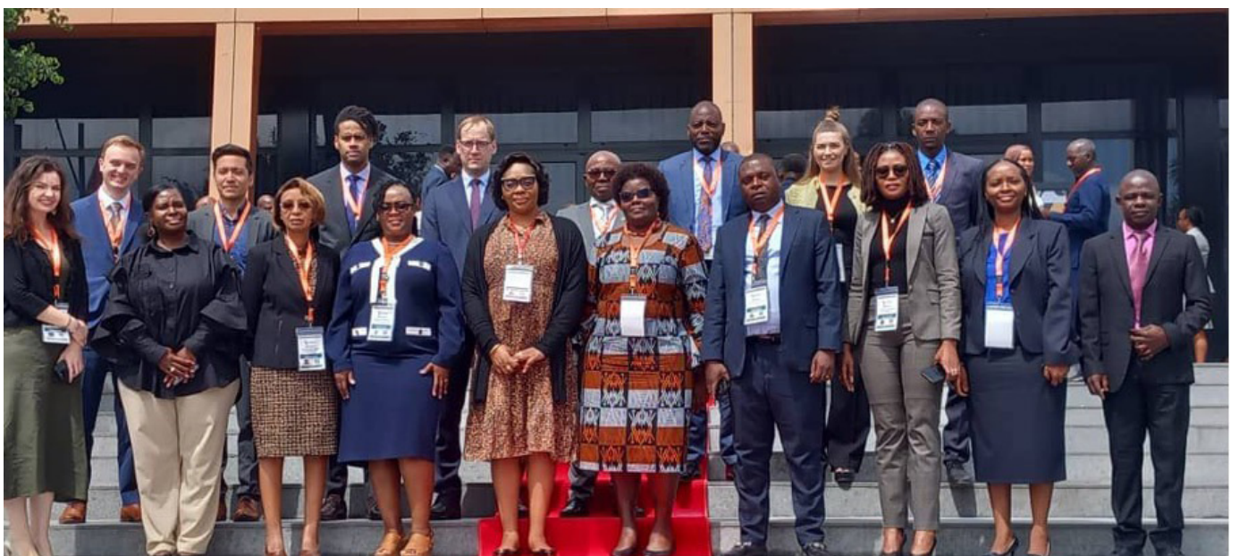
COMESA Secretariat through the Governance Peace and Security Unit participating in the 47th Eastern and Southern Africa Anti Money Laundering Group (ESAAMLG) Task Force of Senior Officials Meeting that was held from 5 - 12 April 2024 in Lubango, Huila, Angola.

These initiatives are supported under the fourth African Union African Peace and Security Architecture (APSA IV) Program, funded by the European Union.