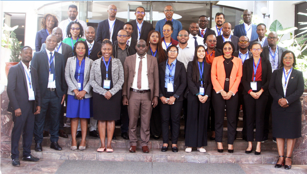
Participants at the Regional training for Financial Intelligence Units on strategic and operational effectiveness and financial intelligence held in Kenya 13 – 17 May 2024

More than 30 officers from Financial Intelligence Units (FIUs) in seven COMESA Member States completed a one-week training in Nairobi, Kenya, focused on strategic and operational effectiveness in financial intelligence. Held on 13 - 17 May 2024, the training is part of the COMESA Secretariat's efforts to combat Illicit Financial Flows (IFFs) and disrupt criminal networks in the region.