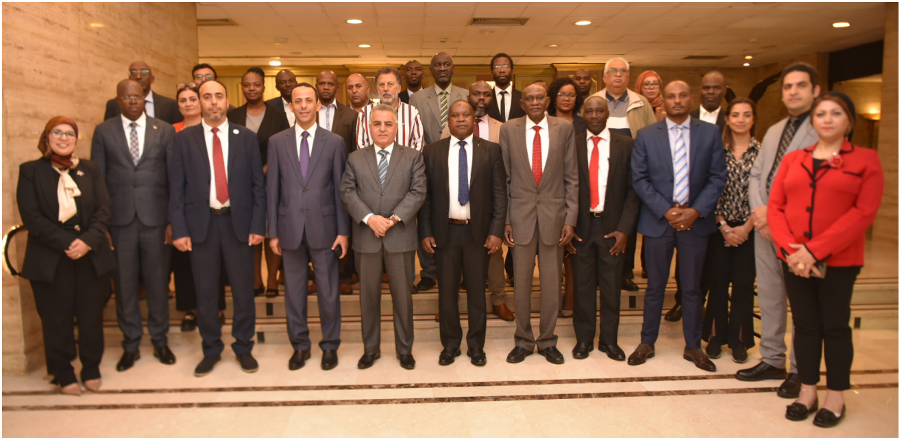
Delegates attending the 13th Annual General Meeting of the RAERESA