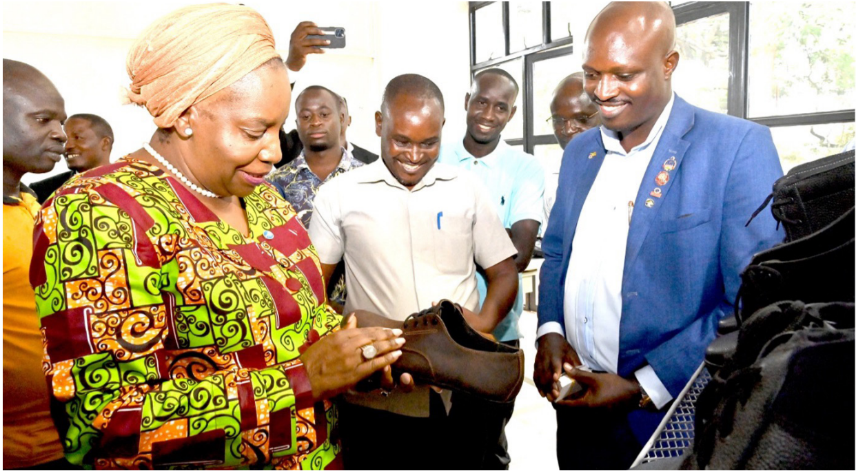
Secretary General Chileshe Mpundu Kapwepwe (L) admires one of the leather products produced at the incubation Centre in Kampala

Uganda's leather sector is poised for significant growth as COMESA pledges to support the industry with modern equipment, leading to more efficient production of high-quality leather and leather products.