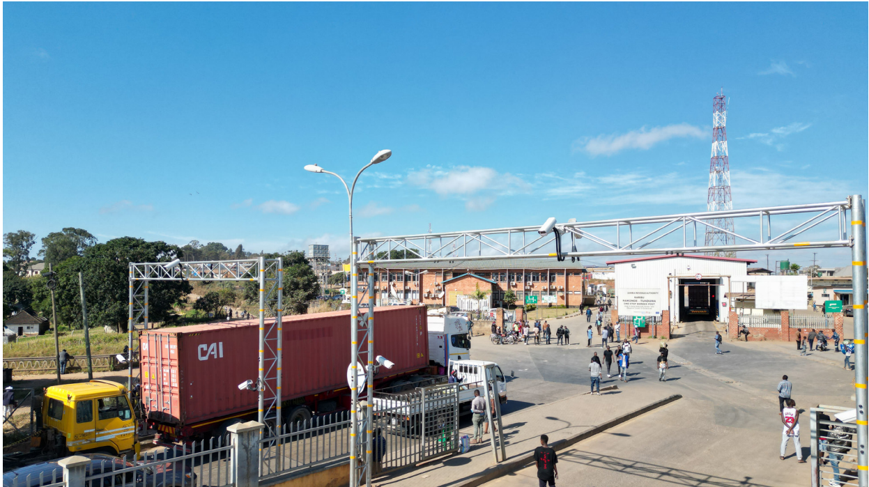
The newly installed cargo Smart Gates at Tunduma OSBP

A team from COMESA Secretariat and the Ministry of Industry and Trade in Tanzania conducted a three-day supervision mission at Tunduma One Stop Border Post (OSBP) in Tanzania on 14 - 17 May 2024. Its objective was to follow up on implementation of activities for upgrading the Nakonde/Tunduma OSBP. The project is funded by the European Union, under the 11 EDF Trade Facilitation Programme (TFP) and Small-Scale Cross Border Trade Initiatives (SSCBTI).