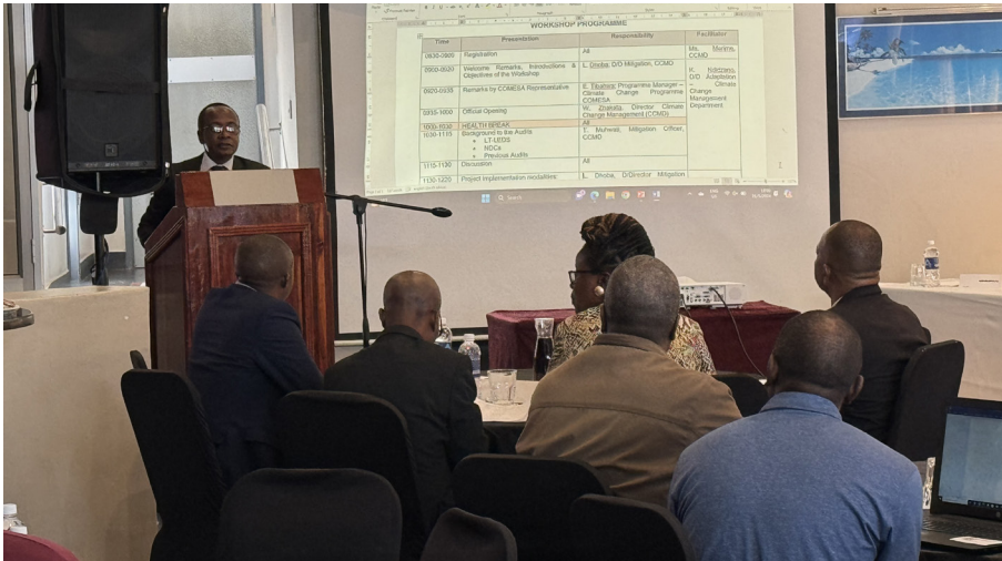
Diverse stakeholders from the private and public sector attending the launch of the eight month project in Harare.