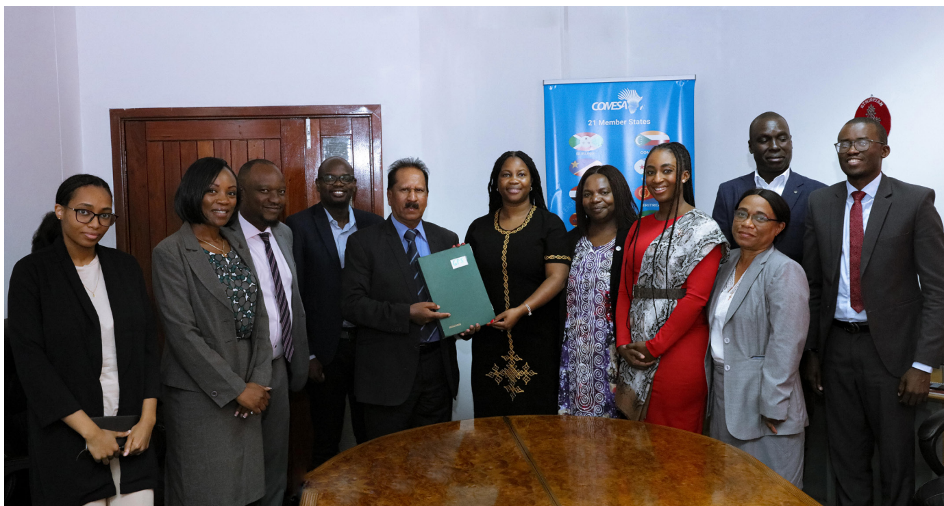
The COMESA and CSVR team after signing the MoU in Lusaka