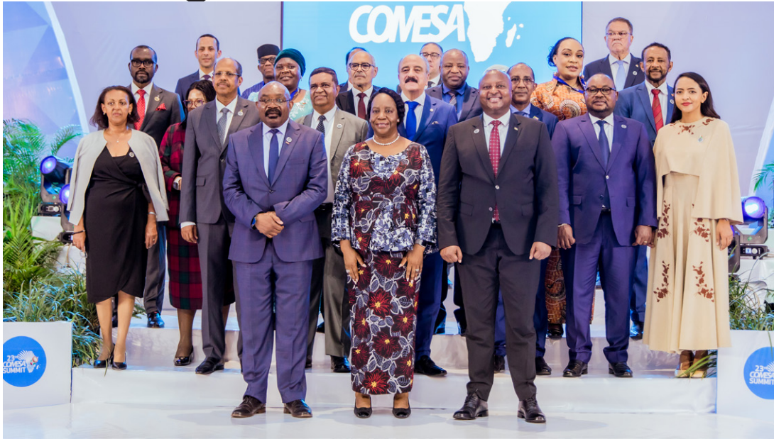
Ministers of foreign affairs and COMESA Secretariat executive management.

Ministers of foreign affairs of COMESA Member States conducted their one-day meeting in Bujumbura, Tuesday, 29 October 2024 with peace and security issues in focus.