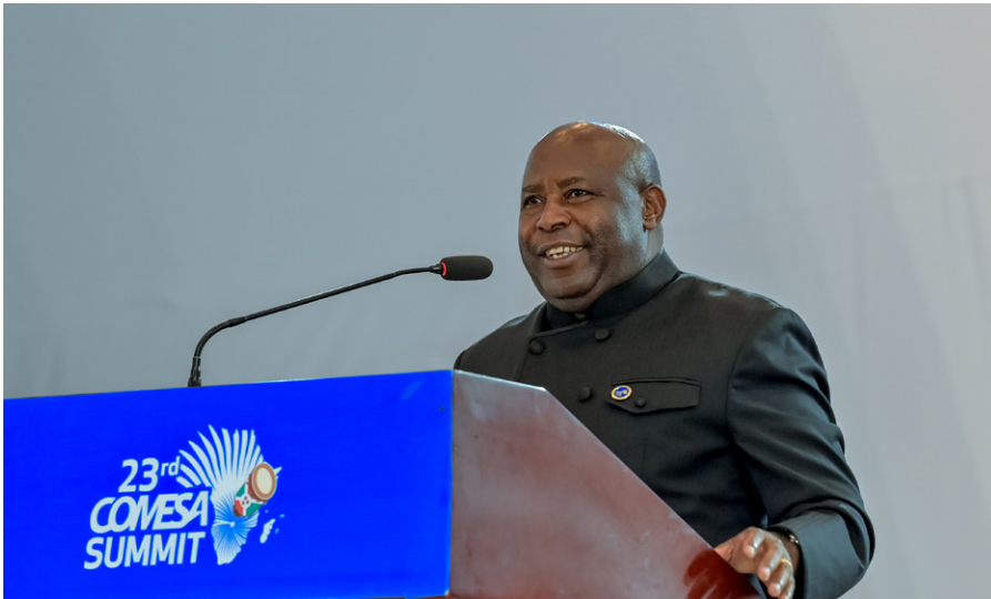
President Evariste Ndayishimiye addressing the Summit